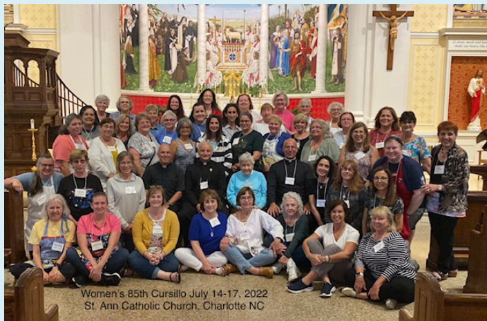
Women's 85th Cursillo July 14-17, 2022 St. Ann Catholic Church, Charlotte NC

NOTE: The following names are listed in alphabetical order and do not correspond to their positions in the photo, which includes the Team Members.