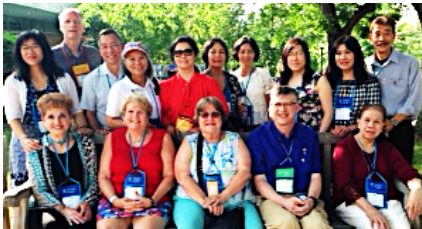
2019 National Encounter Attendees from the Charlotte Diocese